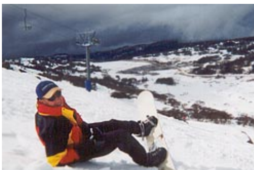
Still smiling...you can't keep a good man down!